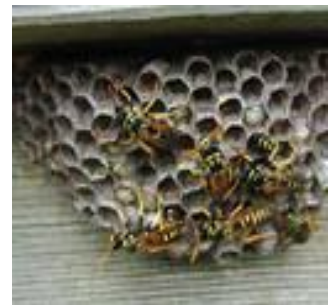
Paper Wasps & Nest

They build nests as pictured often under eaves of buildings or in trees / bushes. Nests are often hard to find but can easily be exterminated by a professional.