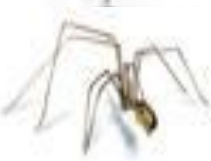
Daddy Long Legs

By having your home sprayed it exterminates all spiders inside and out, thus making your home a safer place.